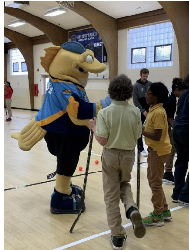
Our second quarter Perfect Attendance and Honor Roll students had visitors from the Walleye Hockey Team this past week! Although not everyone was able to score on spike, they did receive some pretty nice jerseys out of it! 😊